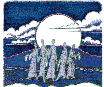
Five wise virgins brought oil for their lamps

Jesus tells this funny story to encourage us to be watchful, yes; to be ready, yes. But he doesn't tell it to make us dour and somber. The heavy-hearted tremble, waver, lose sight of their place and purpose, and fall asleep. The lighthearted know that the unexpected will happen—is bound to happen—so they are awake in their place and ready in their purpose when it comes.